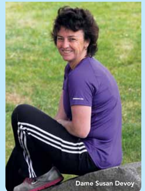
Dame Susan Devoy

"Just being there for them has been so important. Sometimes you don't have to be doing anything much at all. Sometimes just being there is enough." ■